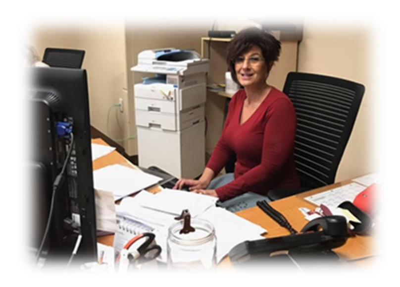
Page 4 of 4

In the near future, the Command Centre will improve their access to software systems and methods for tracking flow in real time. First, we needed to make sure the processes were effective and gave us the information we needed. Adding technology to the Command Centre will help to standardize the information and make it accessible to more people. Soon, the Surgical Program will also be formally added to the Unit Patient Flow Huddles so we can make even better decisions about surgical program patient flow and help fulfill our vision of Outstanding Care, No Exceptions!