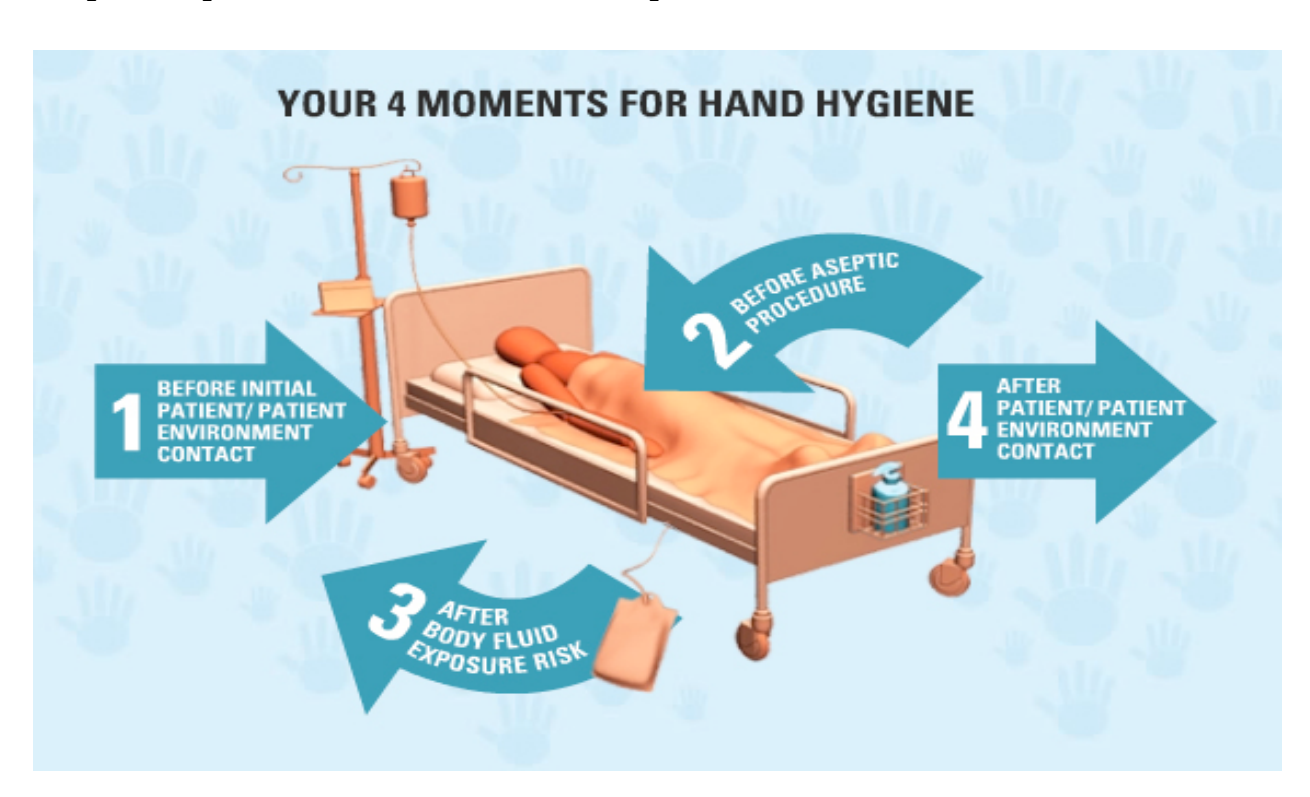
Page 3 of 20