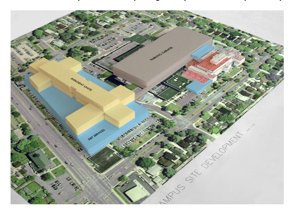
Option 2 – Place new Hospital on current parking and replace current hospital with parking

The Greenfield site option was the least expensive, only 3 years of construction time, no/minimal disruption to patients, families, staff and neighbours, created "swing beds" for crisis issues, allowed for future development and allowed for a more state-of-the-art facility than the other two options.