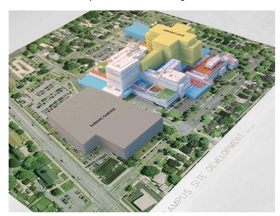
Option 1 – Renovate Existing Site