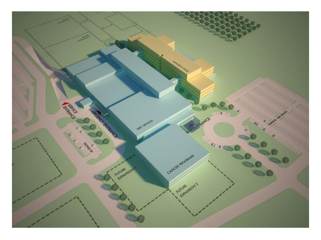
Option 3 – New Greenfield Site

The Greenfield site option was the least expensive, only 3 years of construction time, no/minimal disruption to patients, families, staff and neighbours, created "swing beds" for crisis issues, allowed for future development and allowed for a more state-of-the-art facility than the other two options.