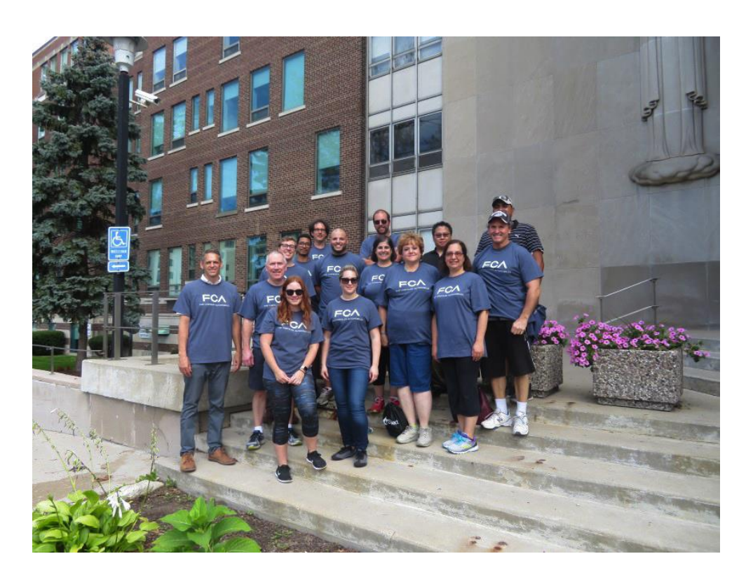
Page 9 of 10

A "shout out" to the FCA Chrysler team and all of the volunteers and staff who participated in Team Clean 2018!