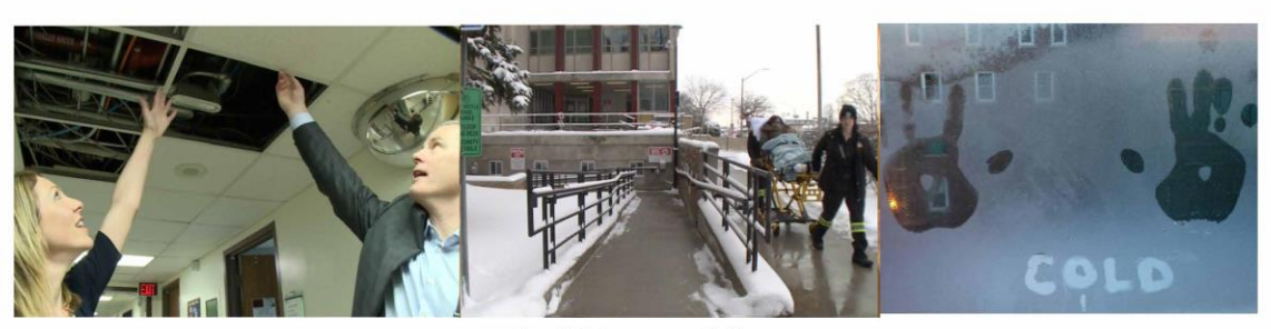
Flood & Temporary Chiller