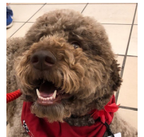
Aria PET VISITATION VOLUNTEER SERVICES