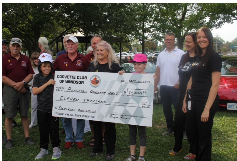
Members of the Corvette Club of Windsor presenting a cheque to patients and staff of Paediatric Oncology at Windsor Regional Hospital.

The club which is active in the community, donated $12,000 this year to Paediatric Oncology. To date, they have supported the unit with over $46,500 in donations. We are grateful for their support and look forward to next year's Corvette show.