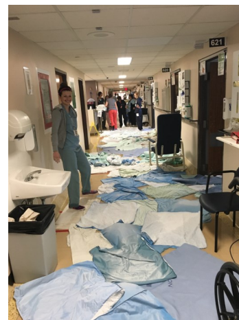
Hallway lined with blankets and towels/napkins to absorb water from flooding