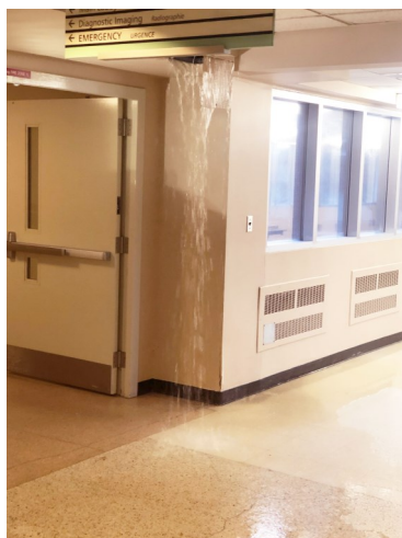
Pipe burst at Ouellette Campus