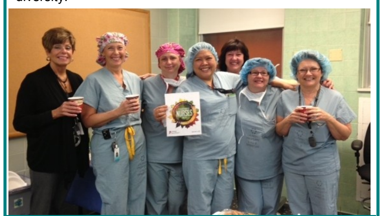
Operating Room management and staff celebrating their successful Perioperative Nurses Week.

The Operating Room Nurses Association of Canada promotes Perioperative Excellence through its core values of leadership, knowledge, competency, continuous quality and collaborative partnerships that includes respect and diversity.