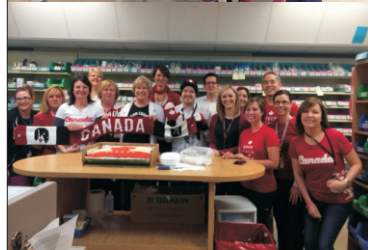
Photographs: Met Pharmacy Staff and Ouellette Pharmacy Staff