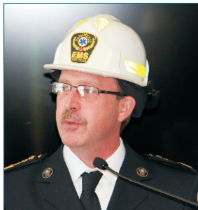
Hats On For Healthcare kicked off its 2014 campaign at EMS in Tecumseh.

Windsor Regional Hospital's Hats On For Healthcare kicked off its annual campaign last Thursday at the new EMS (Emergency Medical Services) Station 25 in Tecumseh with over 15 firms, schools, financial institutions and professional sport teams already signed up to participate.