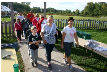
Photo above Walkathon participants on the Ganachio Trail

In Honour of the Ones We Love held their annual walkathon on Sunday, September 28 along the Ganachio Trail promoting cancer awareness and raising funds for key programs like Kids Beating Cancer Little Ninjas Program held at Windsor Regional Hospital.