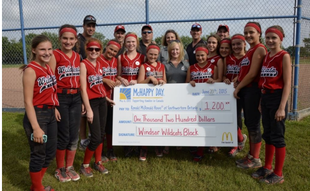
PHOTO ABOVE: Windsor Wildcats 11U Fast Pitch Team celebrating their win and proudly displaying the generous cheque.

The 2 nd Annual Squirrt Invitational Fast Pitch Tournament took place the weekend of June 19-21 at River Canard Park in LaSalle featuring the Windsor Wildcats 11U Girls Fast Pitch Team. All teams participating agreed to donate a portion of the registration fee to the future Ronald McDonald House Charities Southwestern Ontario 'House within a Hospital' coming to Met Campus next year. Up to 12 teams participated and the result saw $1,200 donated to the cause. Representatives from Ronald McDonald House London were in attendance to promote and receive the generous donation.