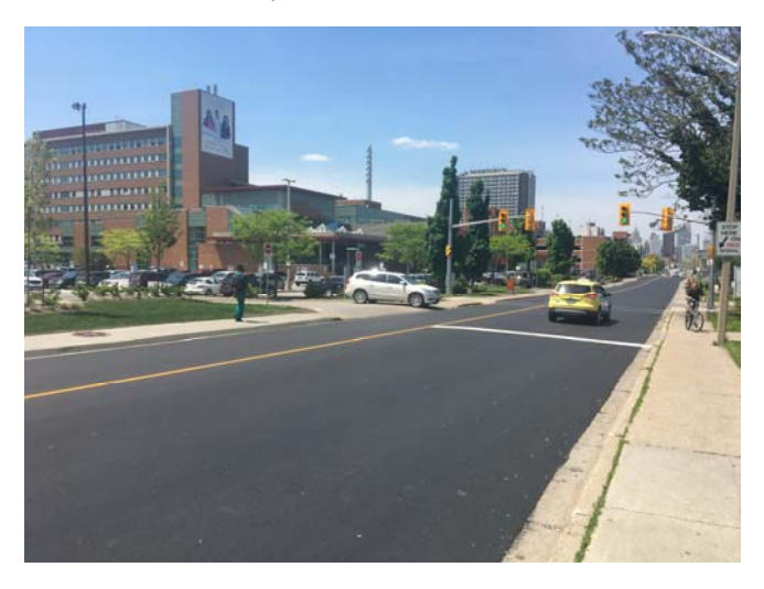
Photo above: View looking down Goyeau Street with newly paved road.

Thank you to the City of Windsor for the efficient work and the construction crews for helping minimize the traffic disruptions to patients, visitors and all of those who went to work or volunteered at the hospital last week.