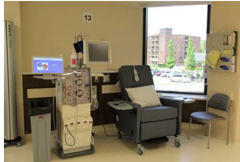
New Renal Dialysis