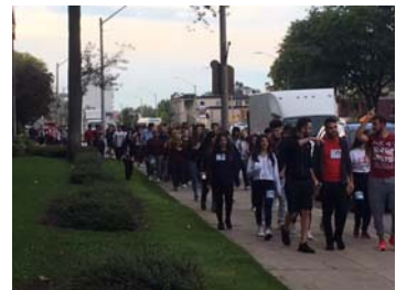
Photo (right): Students walk past the Ouellette Campus in support of the Terry Fox Run.

Visit our website for more information at www.wrh.on.ca