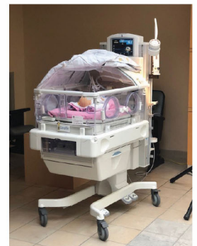
Photo (left) Small Family and photo (right) of Omni Bed Care Station.

SUPPORT WINDSOR REGIONAL HOSPITAL FOUNDATION THROUGH THE NATIONAL BANK FINANCIAL WEALTH MANAGEMENT COMMUNITY SUPPORT PROGRAM