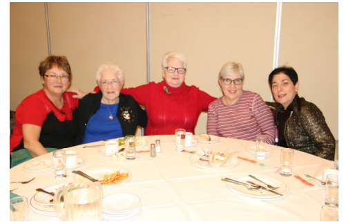
Photo: Retirees enjoying the holiday luncheon held at the Ciociaro Club on November 28, 2018.