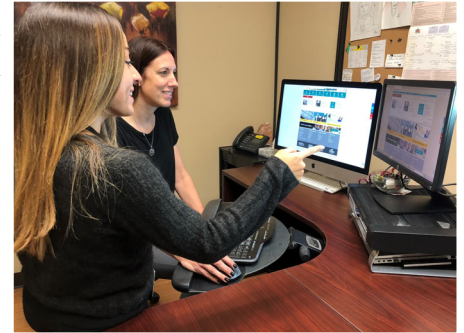
Photo: Windsor Regional Hospital website team reviewing sections of the new website.

This is the first in a multiphase web update. Stay tuned for an updated intranet in the new year.