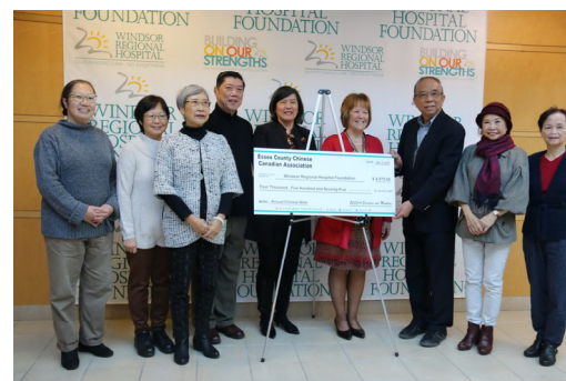
Photo: Members of the Essex County Chinese Canadian Association presenting a donation to the Windsor Regional Hospital Foundation.

Recently, they visited the Met Campus and presented this year's donation to the Windsor Regional Hospital Foundation.