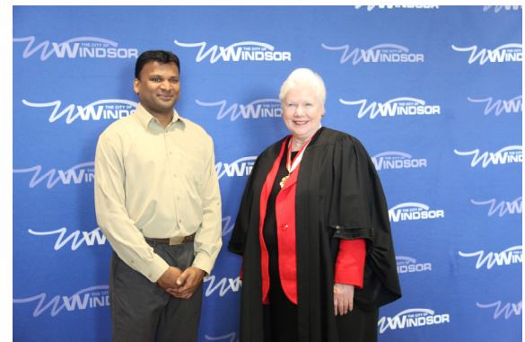
Swearing in of a new Canadian at the Windsor International Aquatic Centre.

DAILY GRILL NOW OPEN EVERY SATURDAY 8:00AM - 2:00PM