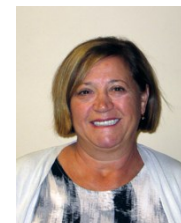
CSR Tech CSR TECH MED DEVICE REPROCESSING