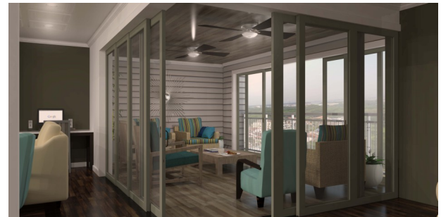
Photo Above: Conceptual rendering of the sunroom/lunai to be constructed in the Ronald McDonald House at Windsor Regional Hospital.

Visit our website for more information at www.wrh.on.ca