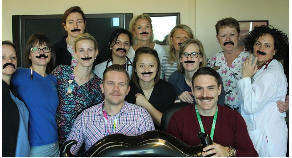
PHOTO ABOVE Staff of 4 West Oncology getting into the act with two real candidates up front in photo, with others simulating as part of the Grow-On Fundraiser.

The Windsor Essex Cancer Centre Foundation is hosting its Grow-On fundraising in support of Prostate Cancer at Windsor Regional Hospital. For information on how to participate, contact the Foundation at Ext. 58506.