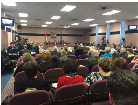
PHOTO ABOVE: Windsor City Council meeting on Monday, April 25, 2016