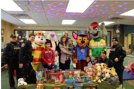
Photo (left): A recent visit from Santa accompanied by Windsor Police officers along with Paw Patrol, Sparky and Elmer made the day.