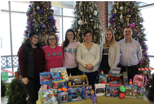
Photo (left): South Windsor Optimist Club teamed up with Delta Alpha Theta donation of $2500 worth of gifts.