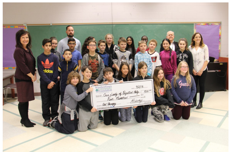
PHOTO ABOVE: Grade 6/7 students at Our Lady of Perpetual Help Catholic School