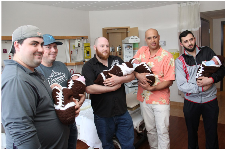
Happy dads showing off their newborns wearing the Super Bowl Cocoons