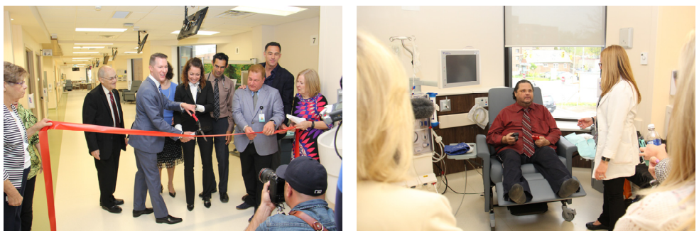
Photo(s) above: Windsor Regional Hospital staff along with patients and volunteers at the ribbon cutting ceremony at the new Regional Renal Program at the Bell Building.