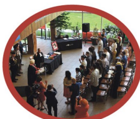
Ceremony at 9AM

Discounted Admission $12 Adults * $7 Children under 12 $2 from each Admission donated to support We Care For Kids (Windsor, ON) Join us for a Citizenship Ceremony as we welcome our new Canadians. For details visit www.adventurebay.ca