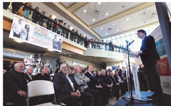
Photo above: Minister Hoskins makes announcement at the Ouellette Campus of Windsor Regional Hospital.

Visit our website for more information at www.wrh.on.ca