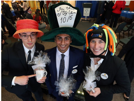
Photo above: Winner of the 2017 "Hats On For Healthcare" Launch fashion show.

For more information, visit hatsonforhealthcare.com .