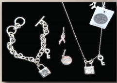
Jewelry available beginning April 22nd, 2019 on-line and in the Foundation Office.

in supporting cancer awareness, research & treatment for women living in Windsor/Essex.