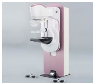
Money from this year's HATS ON FOR HEALTHCARE campaign will help fund DI machines like a new digital mammography and tomography unit that the hospital is in the process of acquiring.

Since this year's event falls on Shrove Tuesday, March 5, the theme is Mardi Gras, but you can wear any type of hat you like! For more information or to sign up your team, department, etc. please visit www.hatsonforhealthcare.com . Your support matters. Thanks!