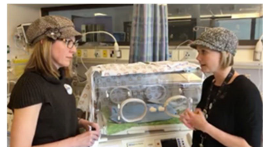
HATS ON FOR HEALTHCARE 2018: More than $47,000 was raised to support the hospital's youngest patients in the NICU unit.

Visit our website for more information at www.wrh.on.ca