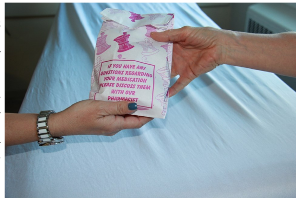
Photo: Thanks to the First Fill Program, pharmacists now deliver patients their discharge prescriptions directly to their bedside before they leave the hospital.

Through the First Fill Program, pharmacists now bring patients their discharge prescriptions directly to their bedside before they leave the hospital. The goal is to eliminate the inconvenience for patients and their families of having to stop off at a pharmacy on their way home. Now, patients can go directly home and focus on having a strong and fast recovery, with no issues. Patients who use the First Fill service will also avoid any problems that may occur at community pharmacies such as, long wait times, improper paper work, and/or not being able to fill the prescription. David Sinewitz, Business Manager at We Care Pharmacy, says "This really is a great service that we are offering. Our We Care Pharmacy Staff have gone above and beyond to make it work and are always coming to me with ideas to make it work even better. In the end, it's the patient who benefits: they get the correct medication at the proper dose and get to ask our pharmacists questions before leaving the hospital for home."