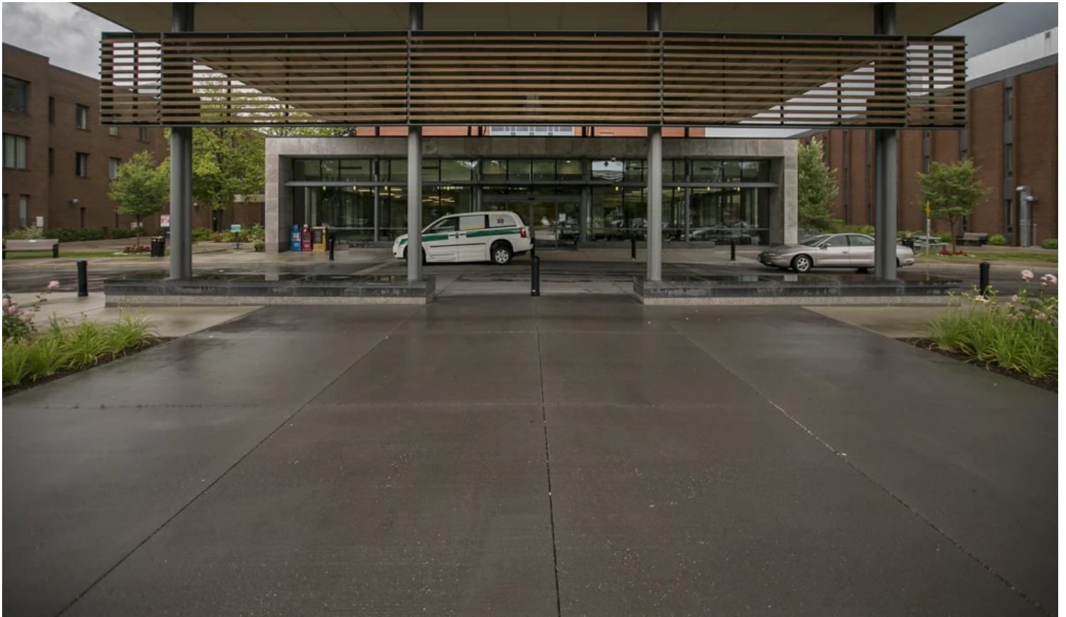
The exterior of Hotel-Dieu Grace Healthcare is pictured Tuesday, July 14, 2015.

[storybar title="Mega Hospital Highlights" link=""]