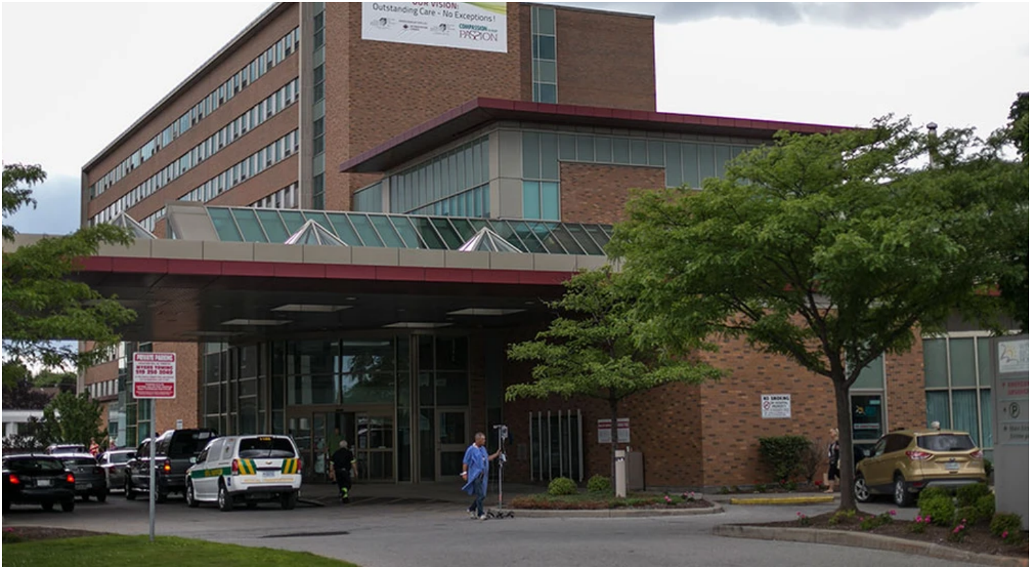
The new mega-hospital plan calls for redevelopment at Windsor Regional Hospital's campuses on Ouellette Avenue and Tecumseh Road, shown, along with the erection of a four-storey, stand-alone emergency department on the former Grace Hospital site.