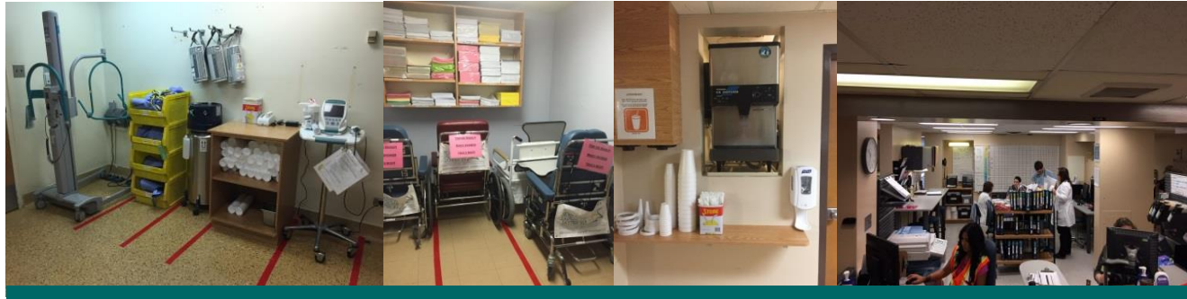
Some of the improvements made by 6E & 6W during the most recent "5S" event at Ouellette Campus

Congratulations to the 5S Team that spent the week of January 26<sup>th</sup> conducting a 5S on 6E and 6W at the Ouellette Campus!!! The goal was to eliminate as many barriers as possible in the workspace that is keeping nurses away from their patients' bedside (i.e., time spent looking for, searching for and collecting items or information). Some highlights of the work completed on the units include the following: