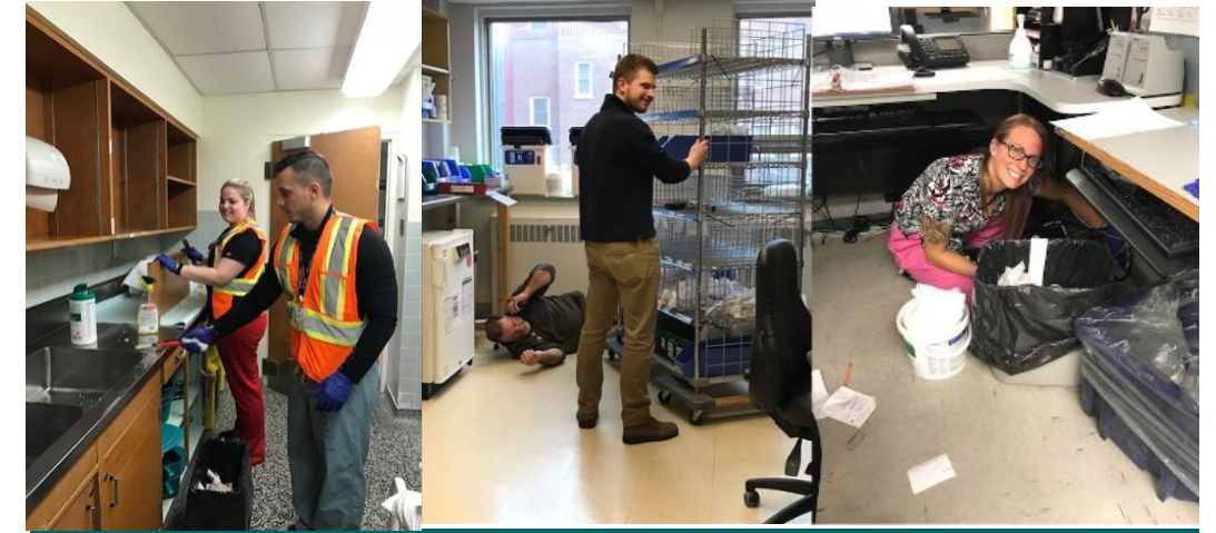
The 5S events involve the work of multiple departments to be successful. SOP would like to truly thank all of the staff involved in these events. Without you they would not be successful. Who will be next????

On Wednesday this week, a team including staff from 4 Medical worked together organizing and decluttering the unit. This was the last of the scheduled 5S events for wave 2 of the Standard Unit.