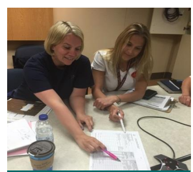
MPIP Team prepares to consult their nursing, physician, and pharmacy colleagues regarding the new BPMH form.