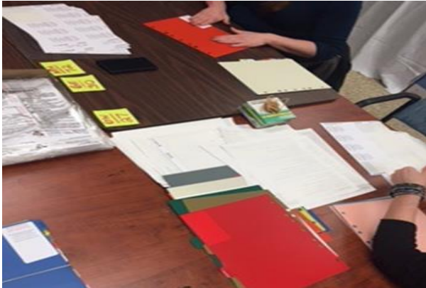
The project team at work – placing document legends on the new patient chart tabs!