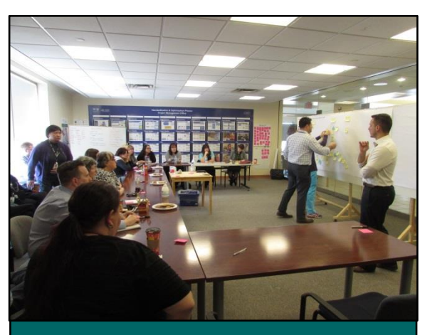
IT TAKES A TEAM: A cross-functional group, including front-line staff, map the process that occurs when a patient is admitted.

The next step for the Patient Flow project teams is to simplify communication in the process so that patients have more seamless transfers and experience shorter waits in the Emergency Department.