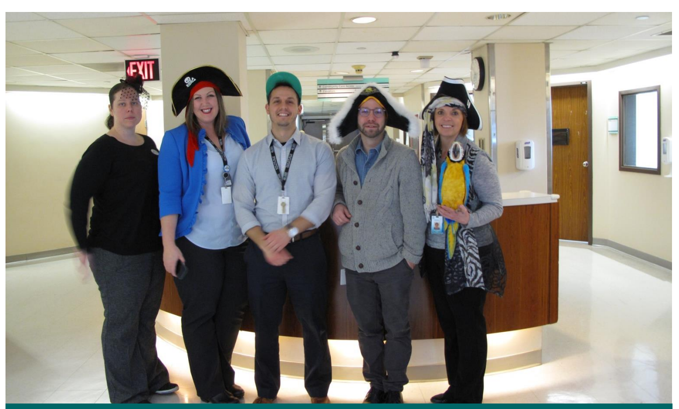
Members of the SOP & Learning and Workplace Development teams sporting their pirate themed hats for the Hats on for Healthcare Initiative