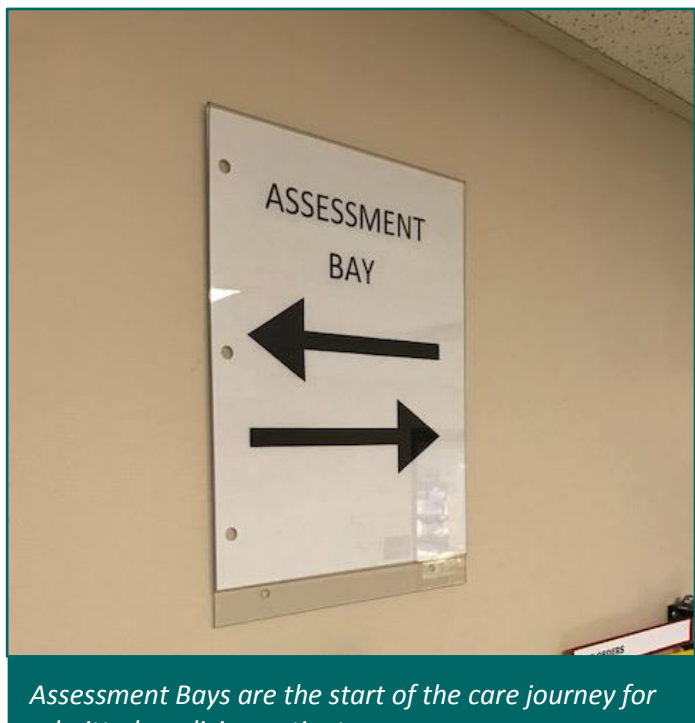
admitted medicine patients.

When the patient arrives in the Assessment Bay they will be assessed by the Most Responsible Physician (MRP) and required tests will be expedited in order to confirm the diagnosis and treatment plan. Patients will be in the Assessment Bay no longer than 24 hours. Patients will either be discharged from the Assessment Bay or moved to an inpatient bed on the same unit. Patients in the Assessment Bays are encouraged to maintain mobility and normal activities of daily living as much as possible. Routine care of the patient does not change.