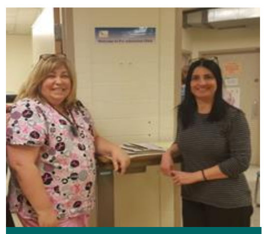
To reduce patient wait times, staff members at the Pre-Surgical Screening (PSS) Clinic at Ouellette Campus are testing future state changes related to a streamlined chart pathway.

Windsor Regional Hospital is set to launch the Lean Six Sigma Belting program. The training and certification program will give participants the skills required to participate in and lead continuious improvement projects in their programs or departments. This will help sustain our current project gains as we move towards more complex, high impact projects. More complex, high impact projects will allow the SOP team to make a significant improvement on our patient's journey. Lean Six Sigma (LSS) provides a comprehensive toolset for addressing complex, cross-functional problems and focuses on patient centric processes.