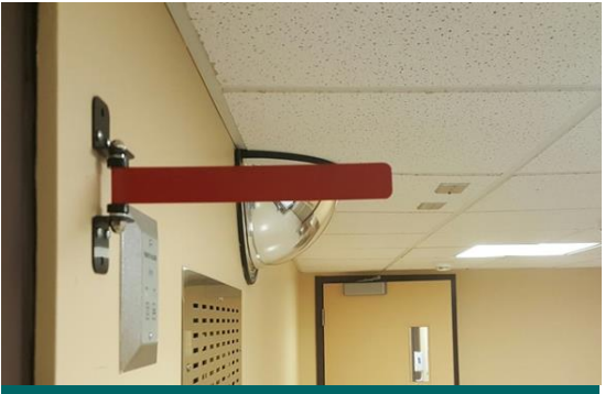
Wall flags have been installed outside operating room (OR) suites at Met Campus to provide a visual cue to Environmental Services staff when an OR suite is ready for cleaning.

A business case on implementing pagers at Met identified that the cost simply did not justify the one minute potential savings per case. However, something still needed to be done so that staff no longer had to rely on intuition to cue the need for Environmental Services. So, the Turnaround