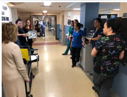
The 7 North Team