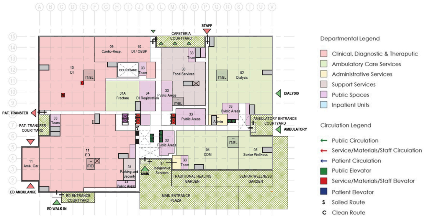
Sample block diagram plan, courtesy of Stantec. This drawing shows all programs and services on an entire floor and their locations in relation to other each other as well as entrance points, elevators and the hallway circulation route. This is a sample of the work being done in this stage and is not related to the current project.