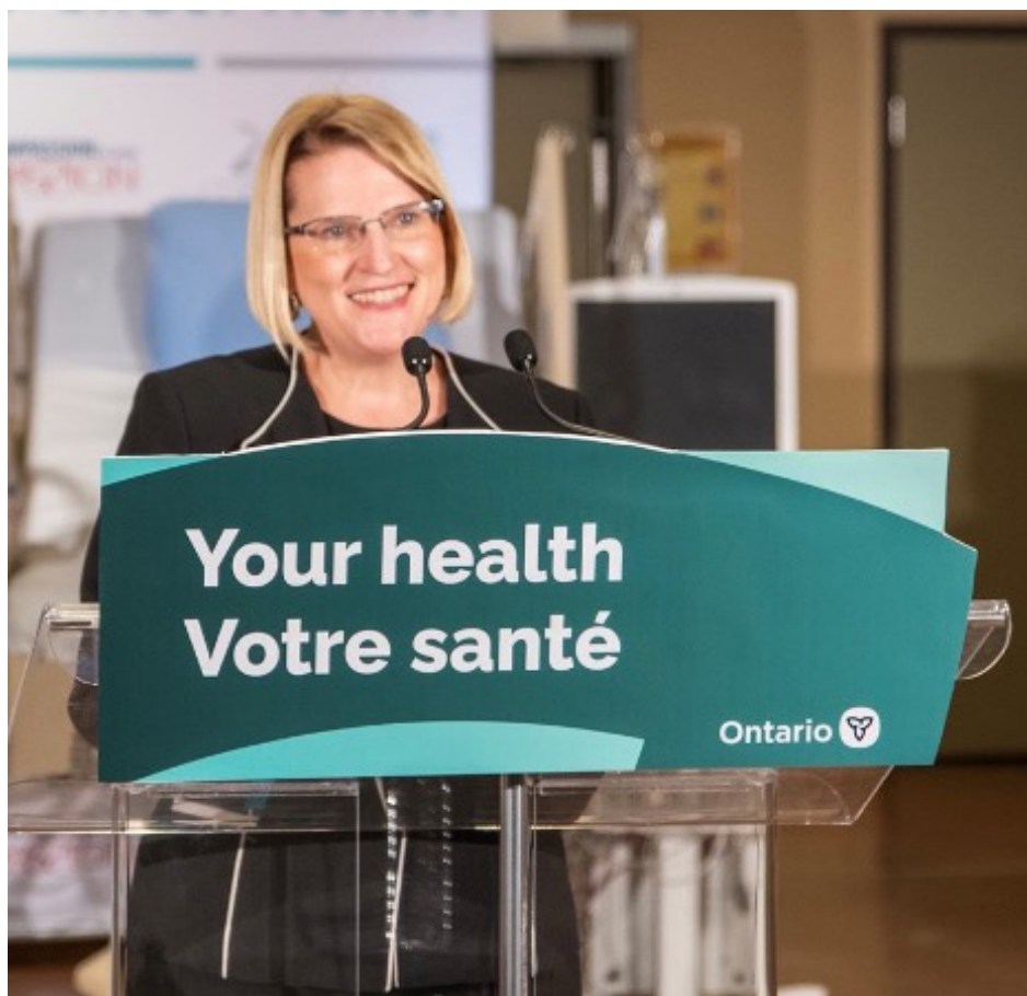
Ontario's Deputy Premier and Minister of Health, Sylvia Jones, speaking at a news conference on January 18, 2022.