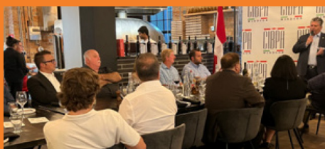
Canadian Italian Business and Professional Association